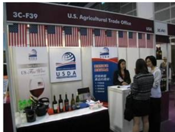
Hong Kong Int'l Wine & Spirits Fair