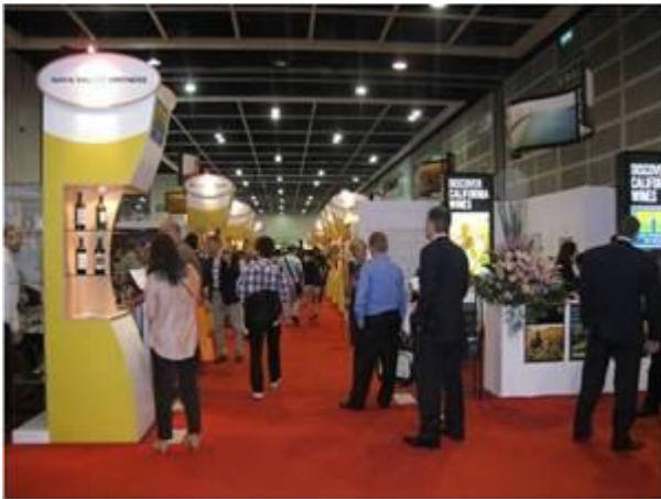
Vinexpo Asia Pacific