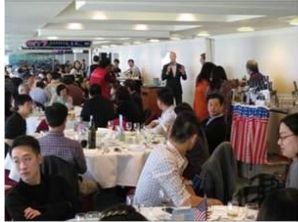
US Wine Fair at Hong Kong Jockey Club