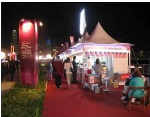
Hong Kong Wine & Dine Festival