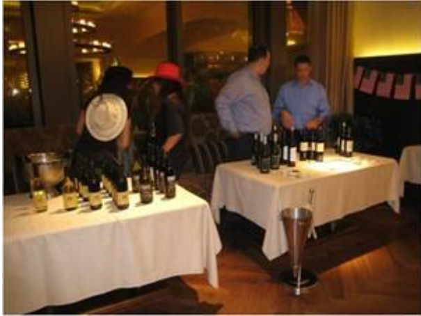
Great American BBQ